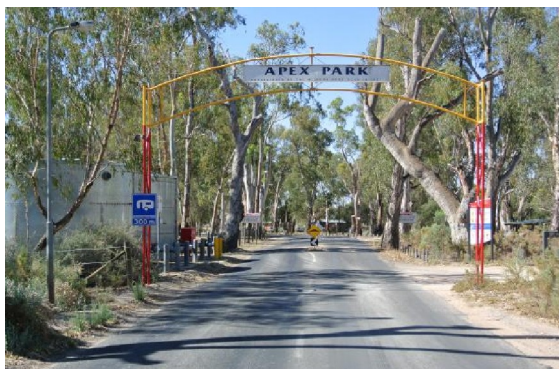
ENTRANCE TO APEX PARK