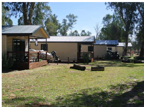
TYPICAL PARK CABINS