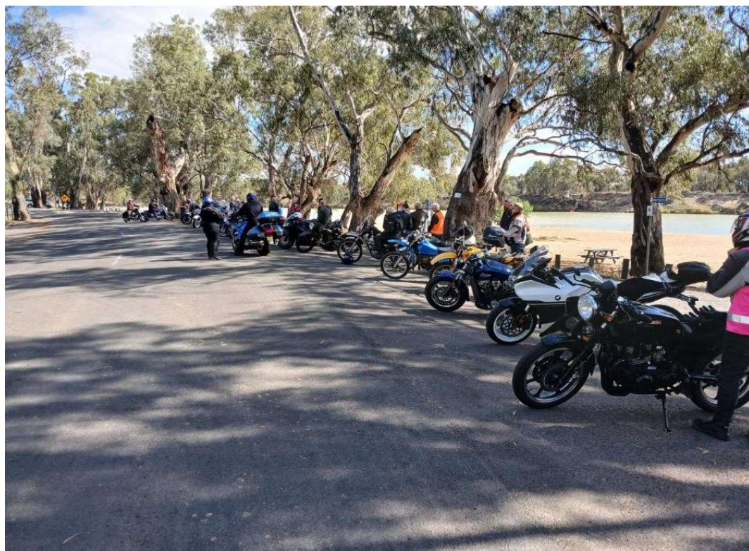
Riders Assembly Area: Apex Park