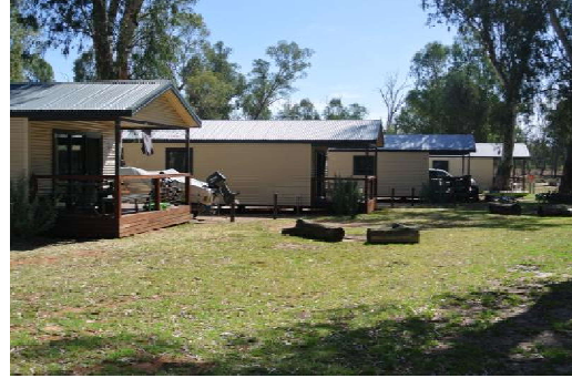
SOME OF THE MANY CABINS