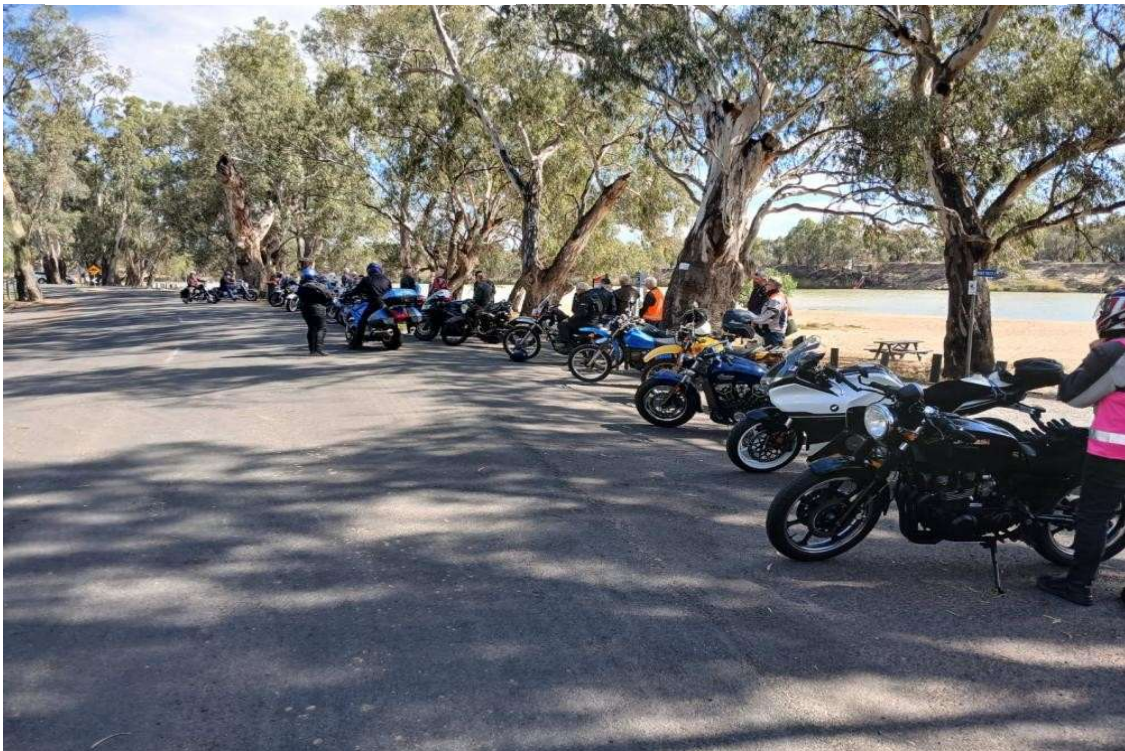
Riders Assembly Area – Apex Park