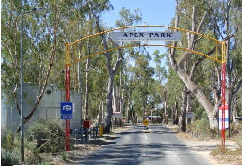
ENTRANCE TO APEX PARK