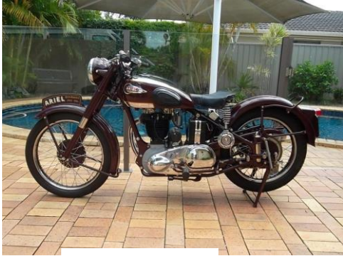
Ariel 500cc VH