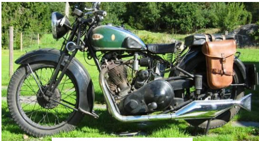
1933 BSA 600