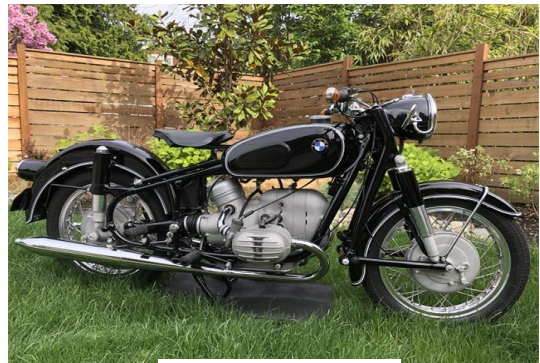
1962 R50 BMW