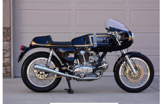
Ducati GT 750